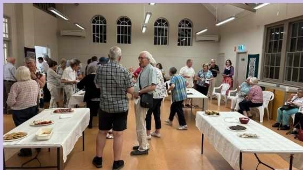
AN ECUMENICAL PREPARATION FOR ADVENT Last Tuesday around 70 people gathered in Holy Family Church for our Advent Ecumenical Service. Pictured here is supper afterwards in St Brigid's Hall.